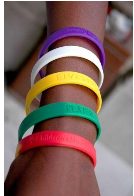
Rubber bracelets and anklets are not allowed